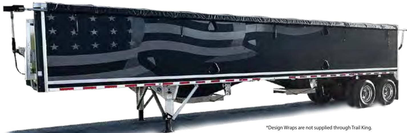
*Design Wraps are not supplied through Trail King.

All specifications are subject to change without notice. Trailers pictured in this brochure may feature optional equipment.