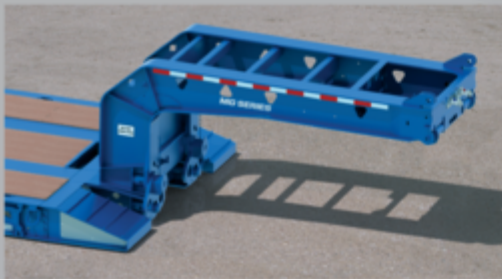
OPTIONAL Narrow Mechanical Gooseneck