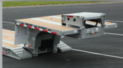
OPTIONAL Full-Width Hydraulic Gooseneck (Shown with optional flip neck)