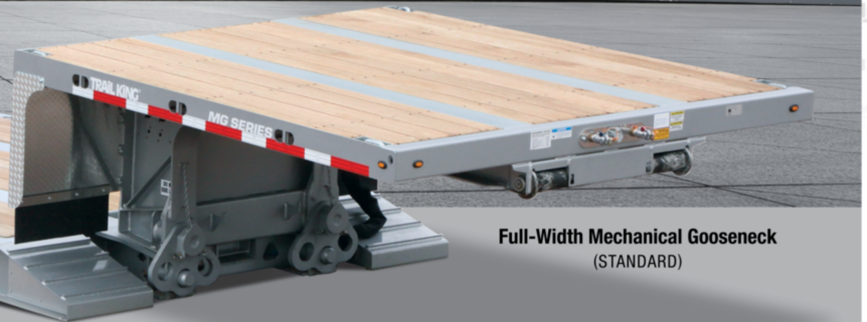
Full-Width Mechanical Gooseneck (STANDARD)