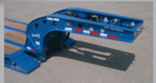
OPTIONAL Narrow Hydraulic Gooseneck

Trail King's Commercial MG-HG Detachable Gooseneck trailer comes loaded with the most standard equipment of any trailer of its kind on the market...as well as a variety of options, including lightweight, corrosion-resistant aluminum features.